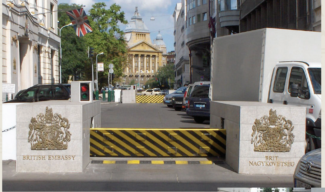
UK Embassy, Budapest