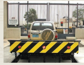
US Embassy, Yemen